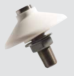
Airbrator Aeration & Vibration

Approvals: Ordinary/General Purpose Only, CE Approved (CSA/UL Approval Pending)