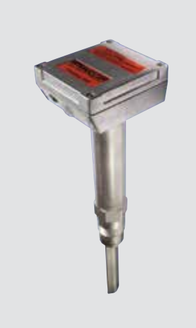
SHT-120/140 High Temperature Vibrating Rod