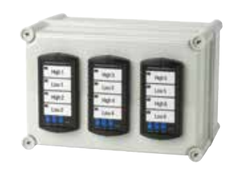
Annunciator Point Level Alarm Panel