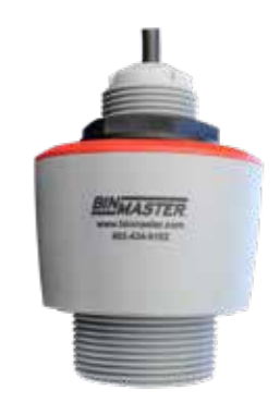
CNCR-120 Compact Non-Contact Radar

Frequency: 80 GHz Beam Angle: 8° (4° for 190)