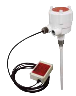
PRO REMOTE Remote Capacitance Probe