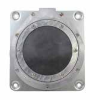
BM45 Diaphragm Switch