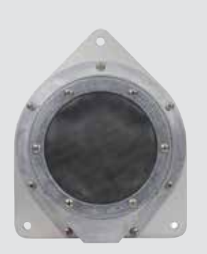
BM 65 Hazloc Diaphragm Switch