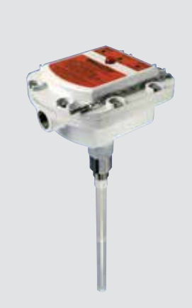
PRO AUTO-CAL Auto-Calibrating Capacitance Probe