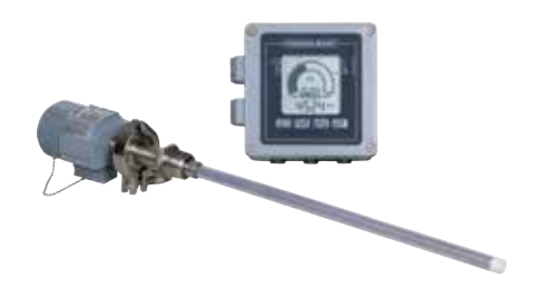
BM-30-LGX Particulate Monitor

Approvals: CSA/US Class II, Division 1 Groups E, F, & G and ATEX Zone 21