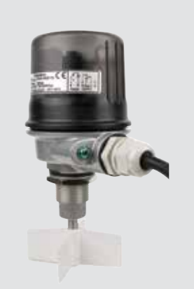
Mini Rotary Compact Rotary