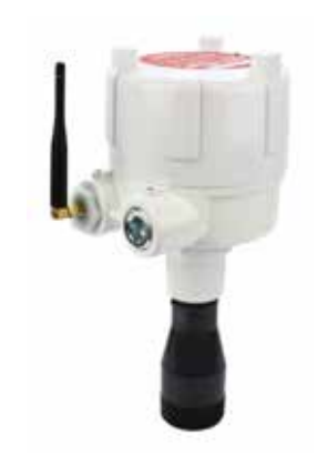
SPL-200/FVL-200 Laser Level Transmitter