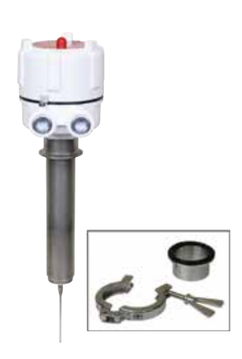
VR-31 Sanitary Vibrating Rod