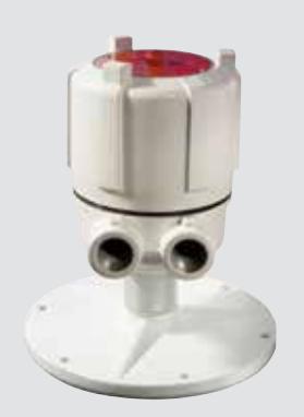
PROCAP I & II FL Flush Mount Capacitance Probe